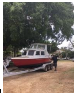
After rehab and ready to launch!